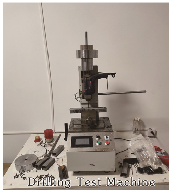
Drilling Test Machine