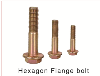
Hexagon Flange bolt