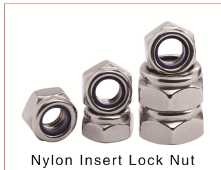
Nylon Insert Lock Nut