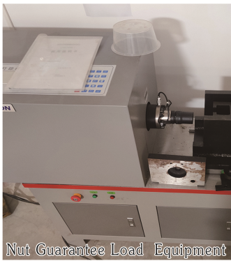
Nut Guarantee Load Equipment