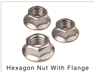
Hexagon Nut With Flange