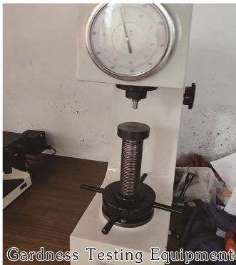
Gardness Testing Equipment